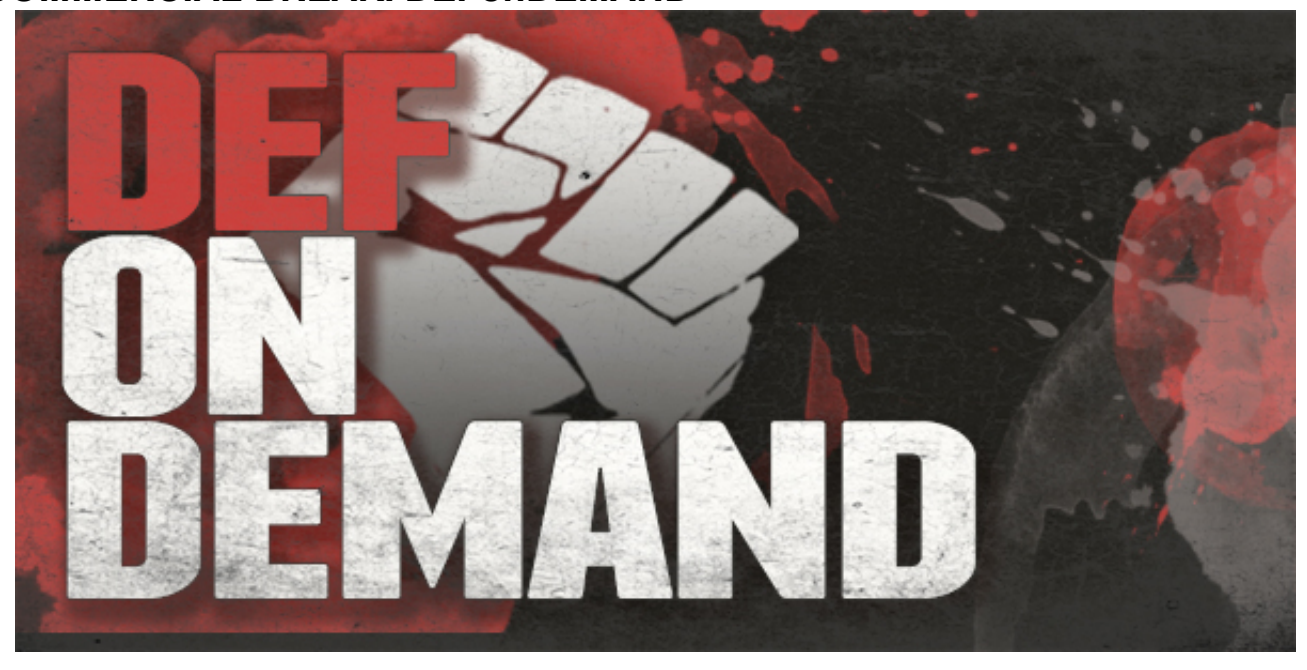
Subscribe to DEFonDEMAND today! DEFY CABLE!