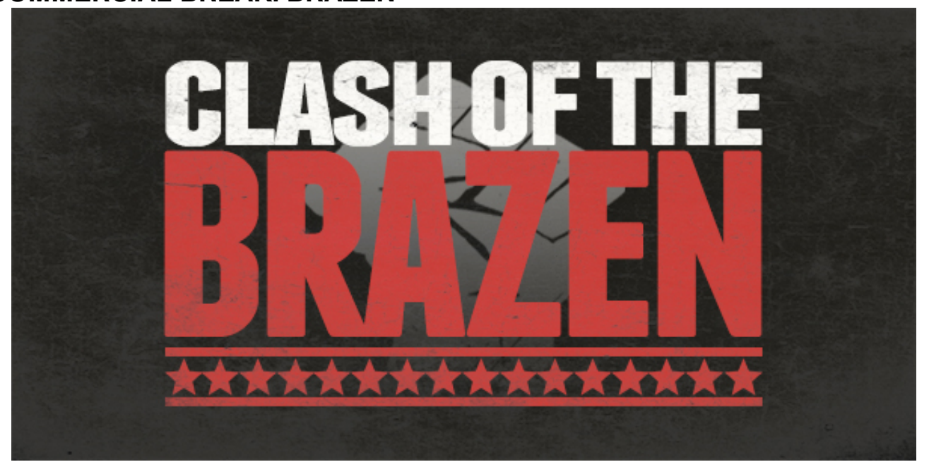
This YEAR ... DEFCON Night IS CLASH of the BRAZEN - LIVE on DEFonDEMAND!!