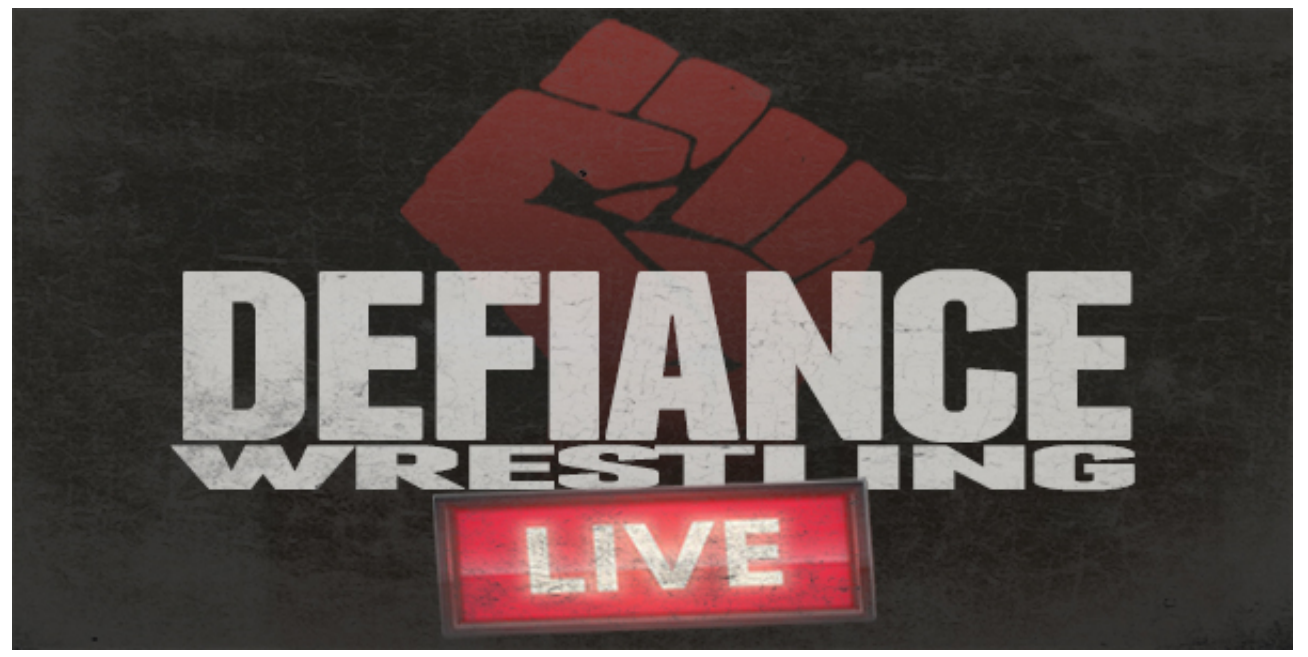
Catch DEFIANCE Live in your town! DEFIANCEWrestling.com