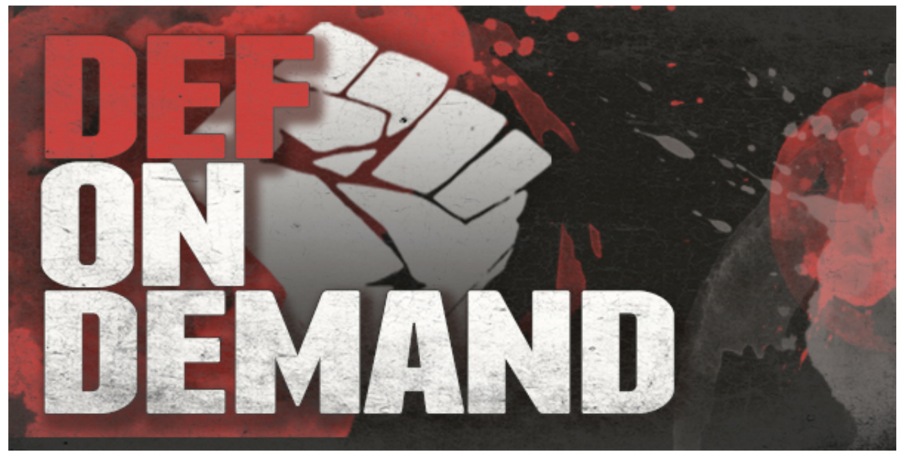
Subscribe to DEFonDEMAND today! DEFY CABLE!