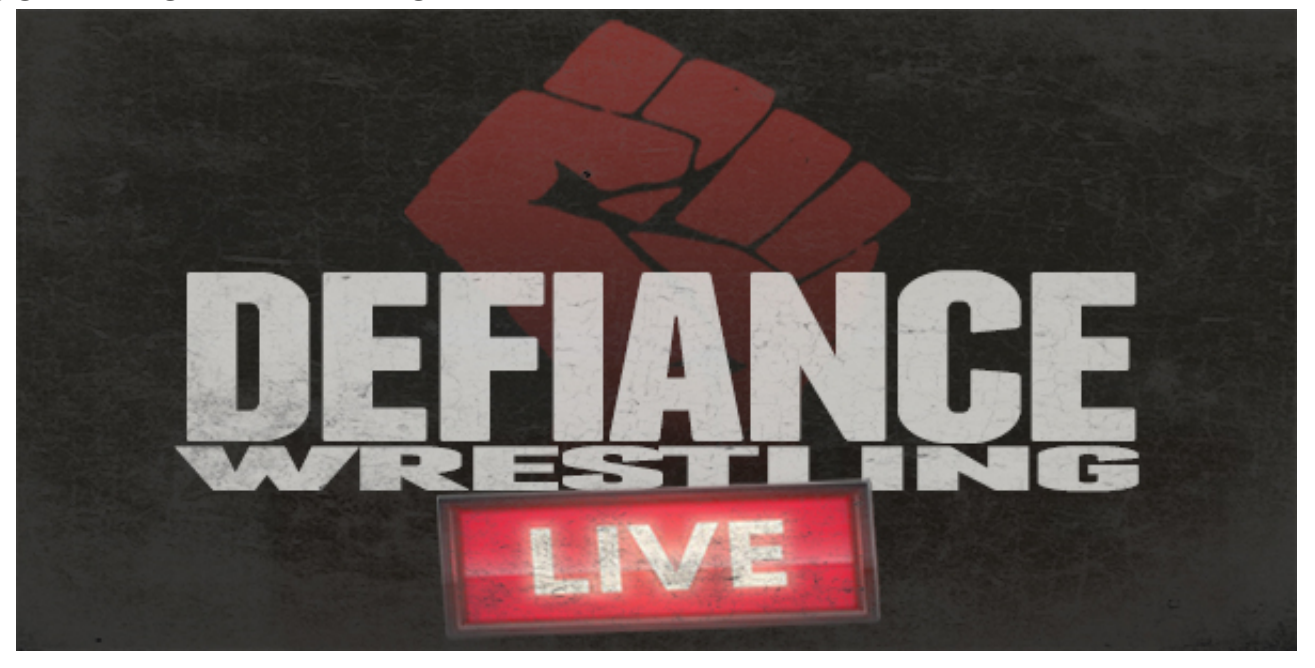
Catch DEFIANCE Live in your town! DEFIANCEWrestling.com