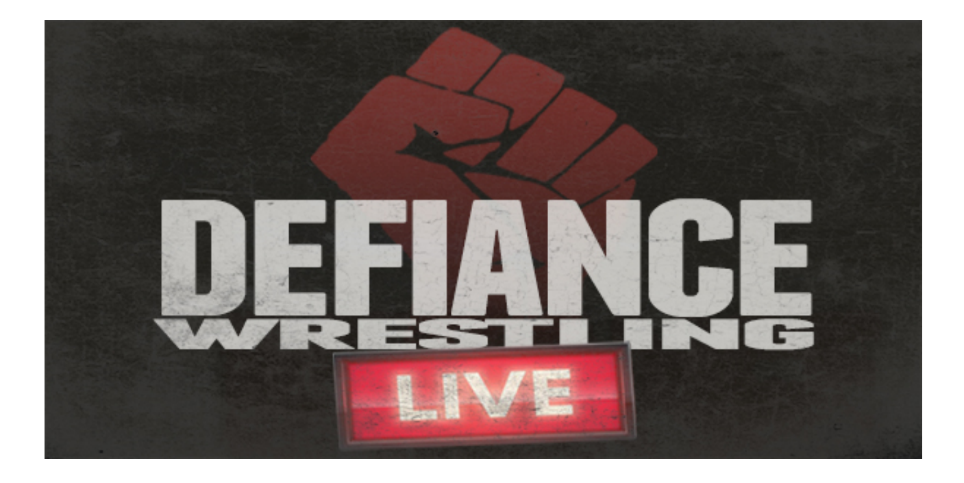
Catch DEFIANCE Live in your town! DEFIANCEWrestling.com