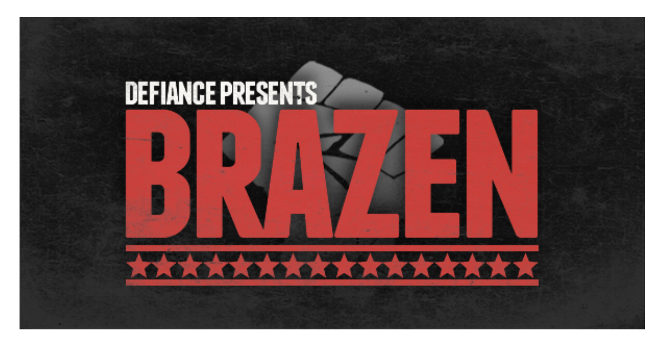
BRAZEN - Where the next generation CLASH!