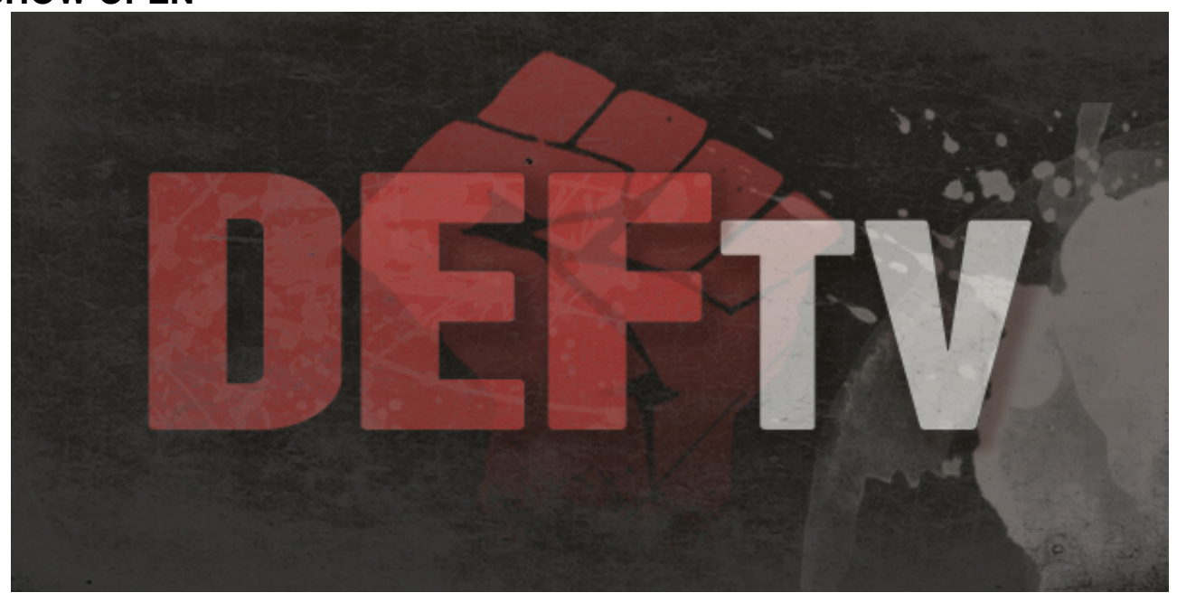
೨ "DEFY" by Of Mice & Men ೨

Bright colorful lights roll across the arena as the Faithful go wild! The DEFtv opening video is playing on the DEFiatron. Many of the wrestlers we see on a daily basis as well as a few legends are shown before the music video comes to an end. The fireworks go off and the fans get even louder in the WrestlePlex as the red lights come to life on the cameras.