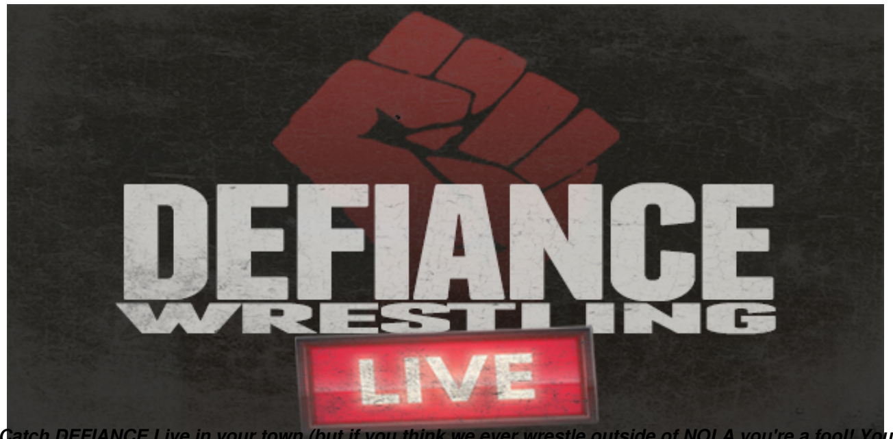
heard me, FOOL!) DEFIANCEWrestling.com