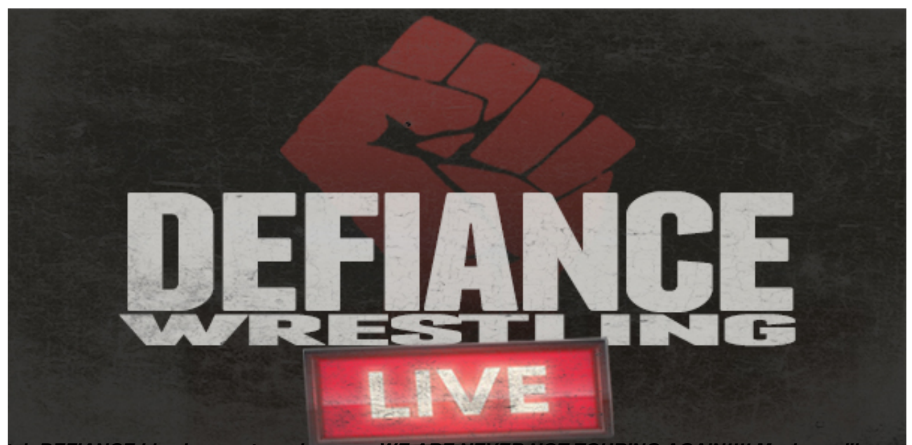
Catch DEFIANCE Live in your town because WE ARE NEVER NOT TOURING AGAIN!!!! Maybe we'll even to Providence, who knows! DEFIANCEWrestling.com